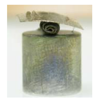
Cantilevered 3M tape